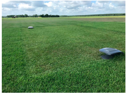
Fig. 2. Elliptical wear pattern that developed close to the charging station. Image was collected in Jul 2018.